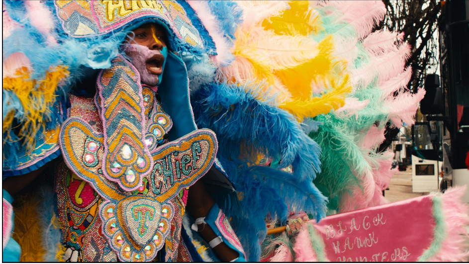
America ReFramed: Big Chief, Black Hawk