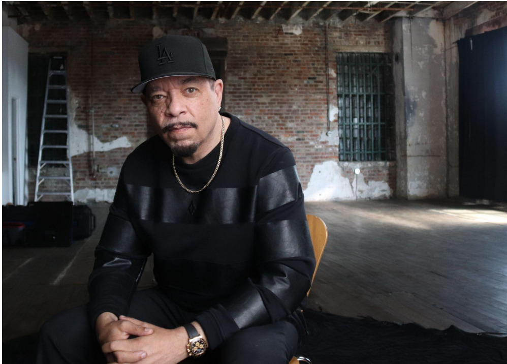
Ice T in Fight the Power: How Hip Hop Changed the World

Sol's children, The Death of My Two Fathers reveals the complexities of identity, the persistence of racial trauma, the challenges of fatherhood -- and the liberation that exists in facing our own mortality.